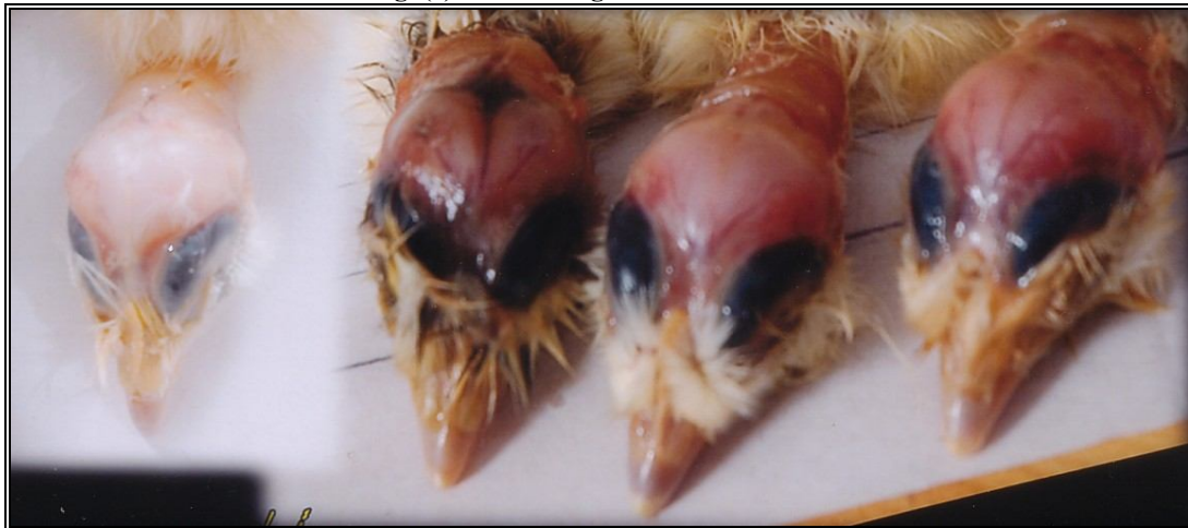
Fig. (3): Petechial haemorrhages in brains of experimentally infected chicks