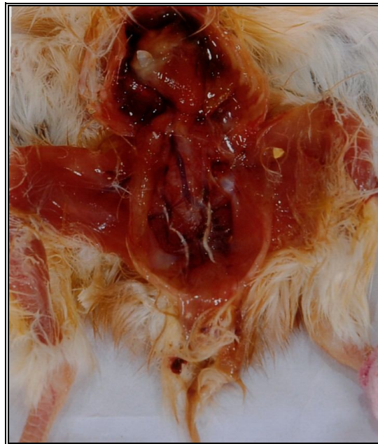
Fig. (7) : Congestion of kidneys with precipitation of urates in the ureters