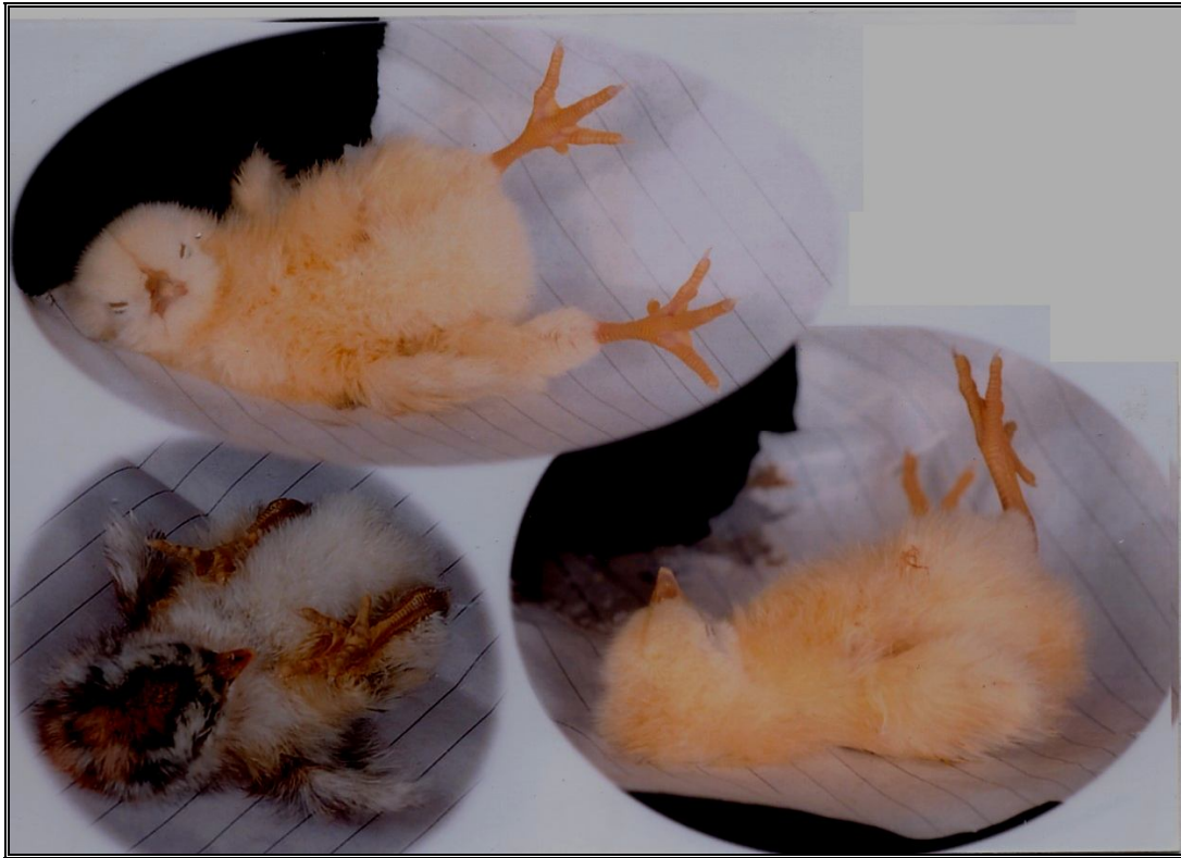
Fig. (6): Experimental infected chicks showed nervous signs