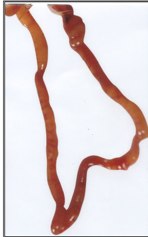
Fig. (5): Shows enteritis