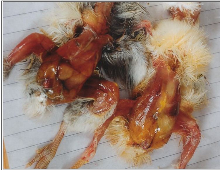
Fig. (2): Shows congestion of all carcass