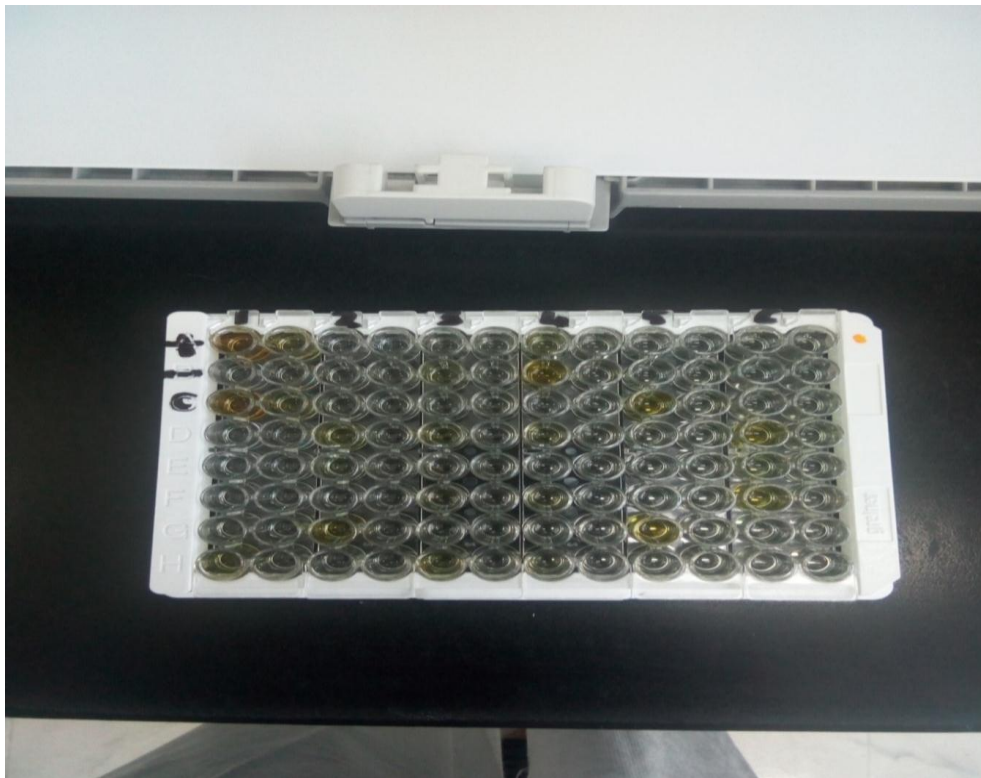
Photo 3; Show the results of MONOSCREEN ELISA (ELISA kit for serodiagnosis of Bovine Adenovirus 3 in buffalo's serum samples).